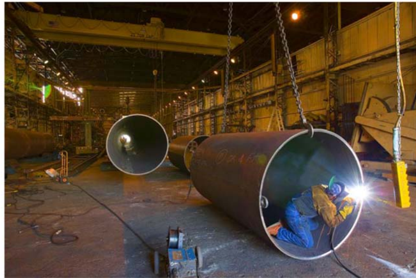
Layout area South of Building 40

Steel fabrication is common within both buildings 40 and 41. The open air environment easily facilitates heavy metal projects.