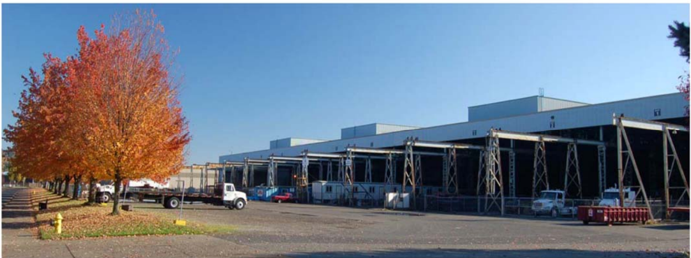
Building 41 - looking East