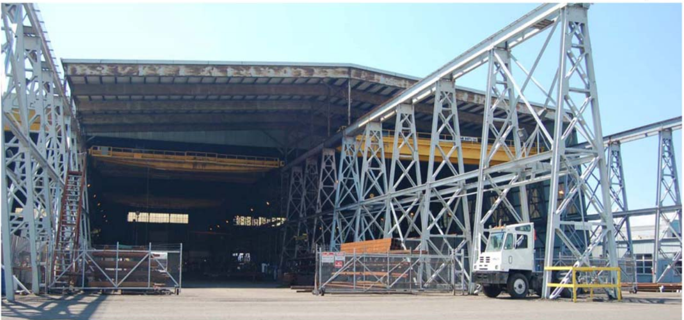
Building 40 - Bay 2